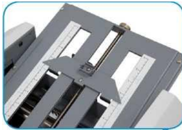
Sliding Fold Plates with Fine Tuning Knobs