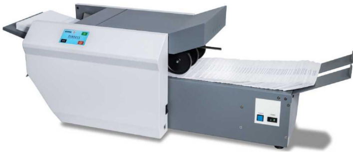
Shown with optional 18" conveyor