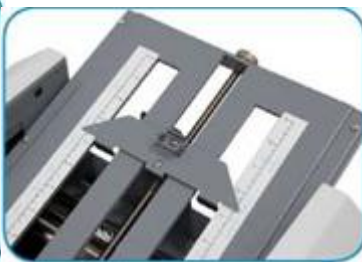
Sliding Fold Plates with Fine Tuning Knobs