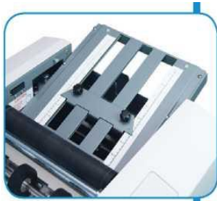
Redesigned fold plates - Clearly marked and easier to adjust