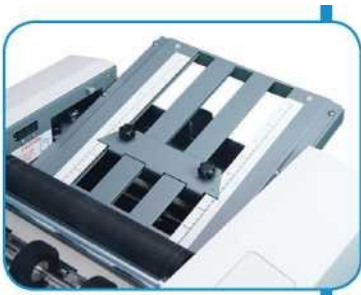
Redesigned fold plates - Clearly marked and easier to adjust