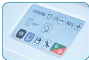
NEW Full-color touchscreen