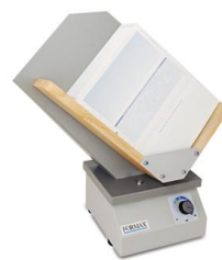
Table Top Jogger