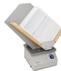
Table Top Jogger