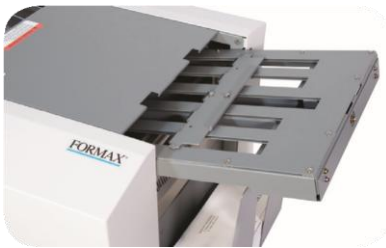
Automatically adjusting fold plates make for quick and easy set-up