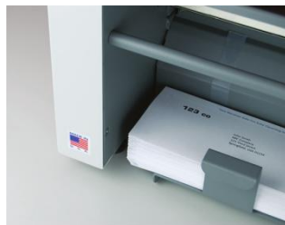
Proudly made in USA