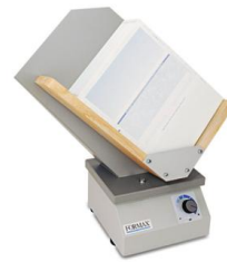
Table Top Jogger