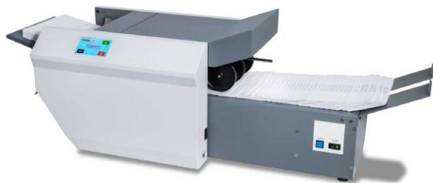
Shown with optional 18" conveyor