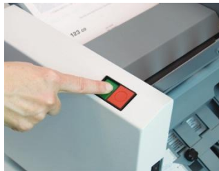
Ergonomic ON/OFF switches